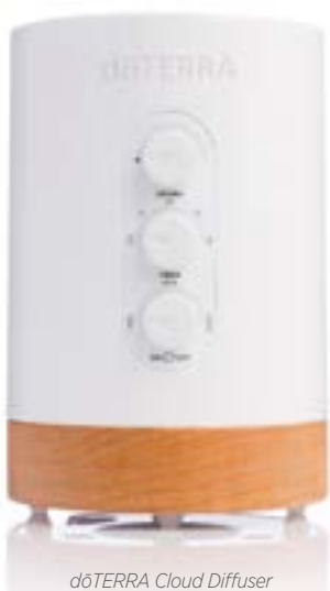
dōTERRA Cloud Diffuser