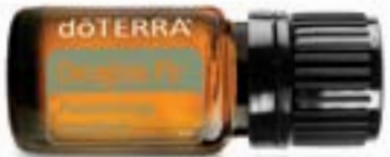
DOUGLAS FIR ESSENTIAL OIL SEE PAGE 8