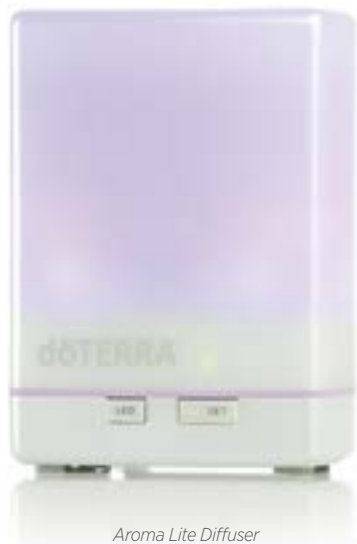
Aroma Lite Diffuser