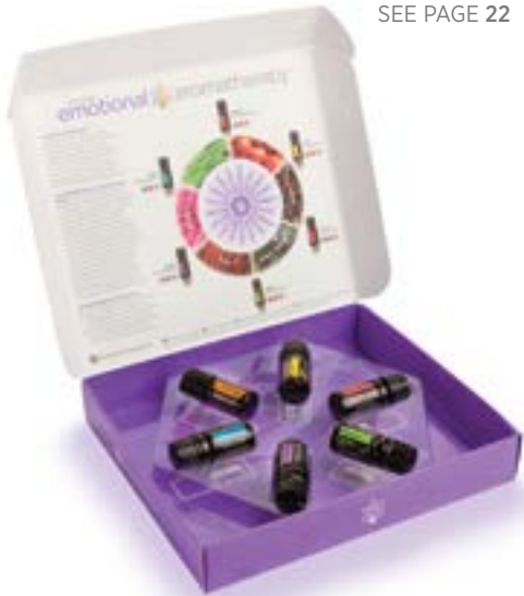
EMOTIONAL AROMATHERAPY SEE PAGE 22