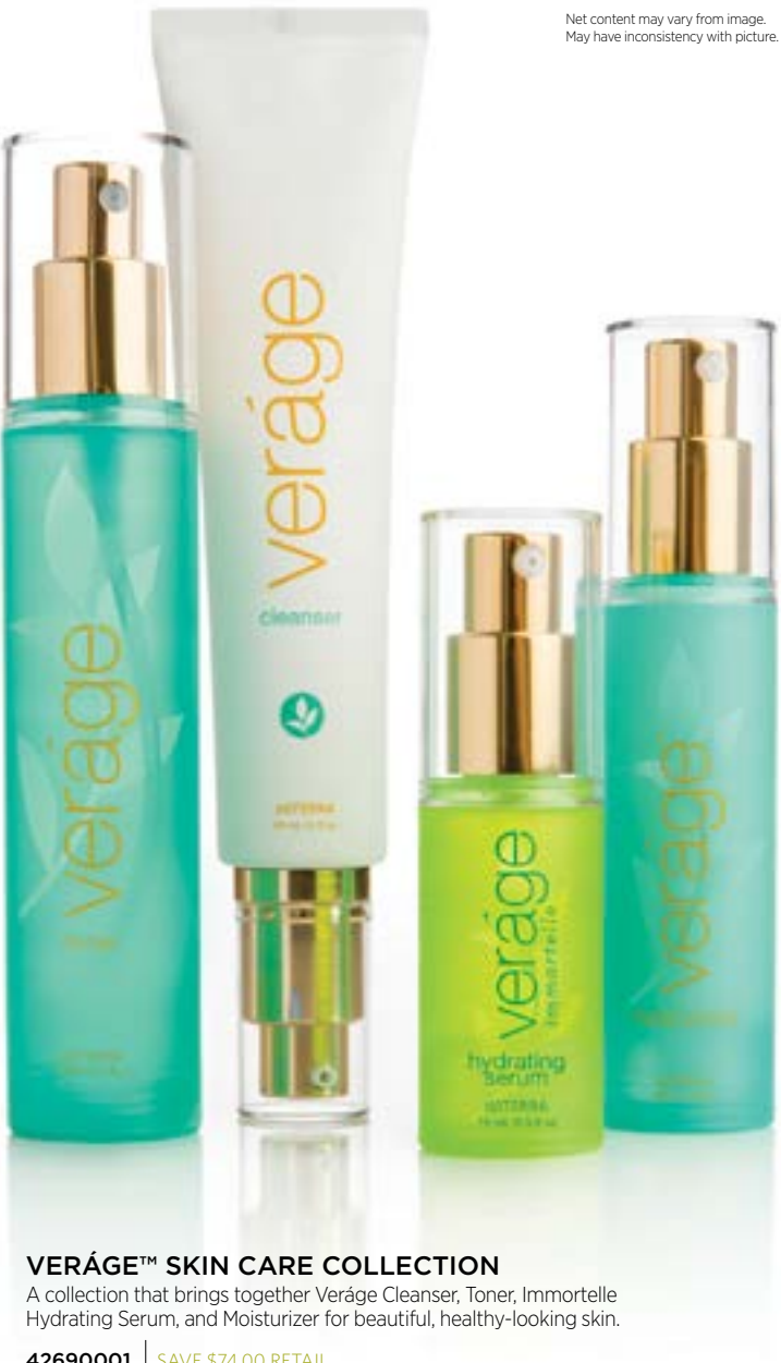
Net content may vary from image. May have inconsistency with picture.

A collection that brings together Veráge Cleanser, Toner, Immortelle Hydrating Serum, and Moisturizer for beautiful, healthy-looking skin.